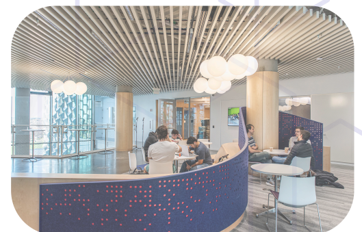
Kempner space in Harvard Science and Engineering Complex.