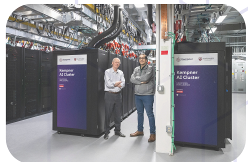
Kempner Institute AI Cluster at Massachusetts Green High Performance Computing Center (MGHPCC).